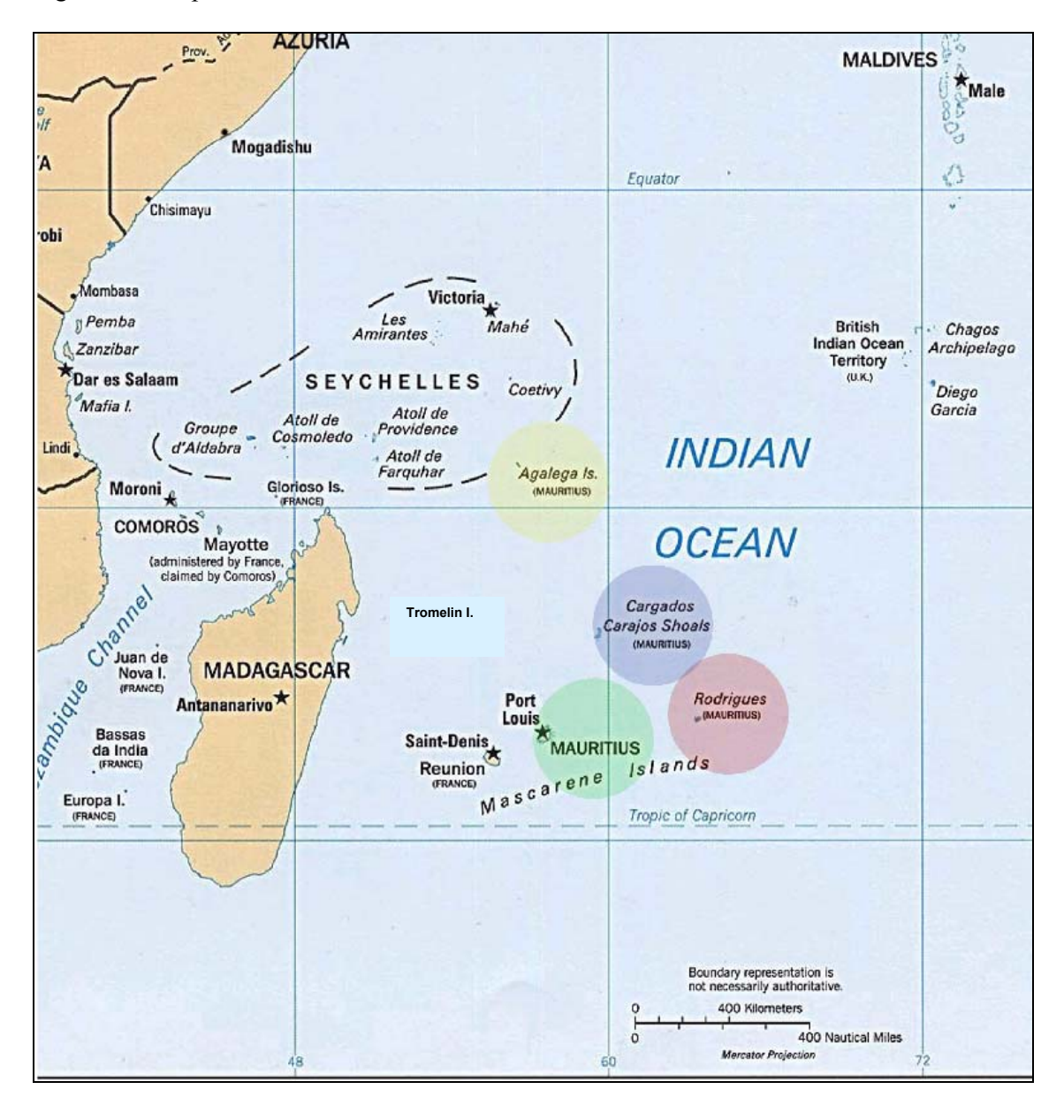
Figure 1.1: Map of the Western Indian Ocean Islands

The Republic of Mauritius is located in the Indian Ocean 800 km southeast of Madagascar. It consists of two main islands, Mauritius (1865 km²) and Rodrigues (109 km²) and two groups of outer islands, namely the St Brandon Archipelago (3 km²) and Agalega (c21 km²) (Figure 1.1). The total land area of the Republic of Mauritius is 2,040 km² with an Exclusive Economic Zone (EEZ) extending over more than 2 million square kilometres.